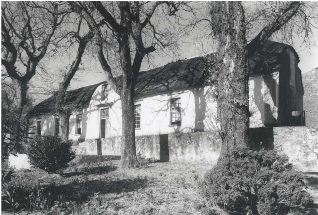
Moddergat [Arthur Elliot KAB Elliot 917]

1.1.5 Nicolaas Anthonie ~ Cape Town 17.9.1780 d.1.12.1783