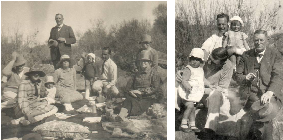
Serrurier Family picnic